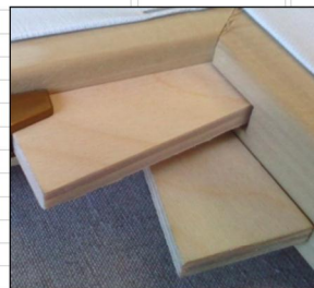
8x Birch Ply Wedges