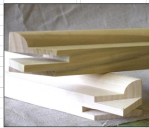
Solid Wood Moulded Stretcher Bars