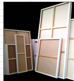
Any Size Canvas Made