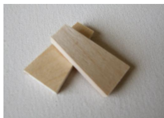
Birch Ply wedges