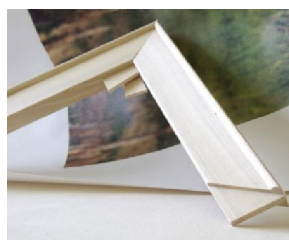
25mm Premium Bars