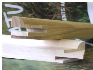
44mm Premium Bars

Professional Single and Notched Cross Braces 16mm(d) x 60mm(w)